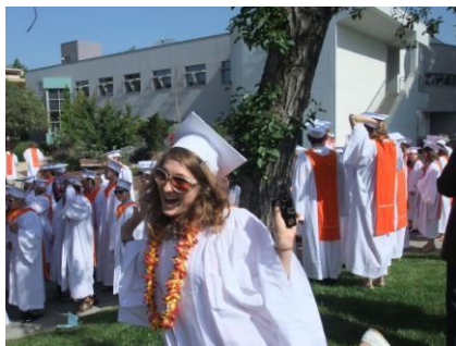
My Wonderfully Graduated Daughter!