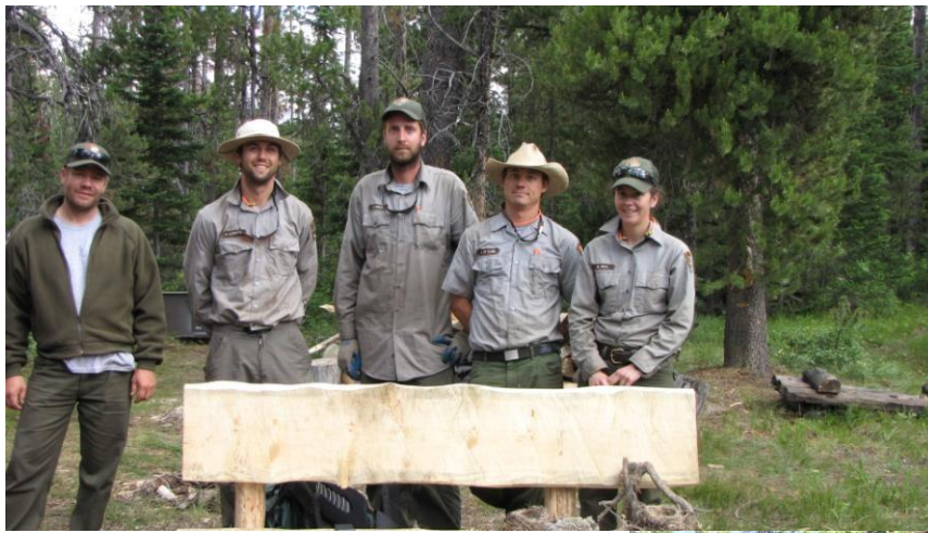
Trail crew camping by our cabin